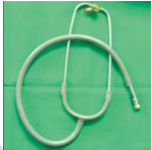
Figure 5: Modified stethoscope