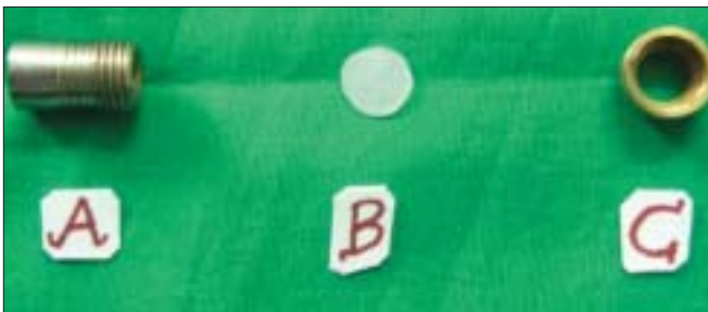
Figure 3: Metal tube (A), Stiff membrane (B) and Metal cap (C)