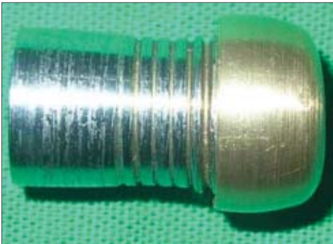
Figure 2: Soundscope