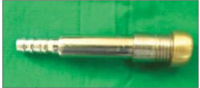
Figure 4: Metal connector inserted into the soundscope