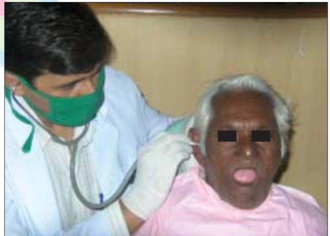
Figure 6: Auscultation of TMJ sounds by modified stethoscope

apart the adhering surfaces. This breaking apart of adhesions can be felt as a click and it denotes the instant return to normal range of mandibular movement.