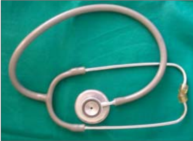
Figure 1: Stethoscope