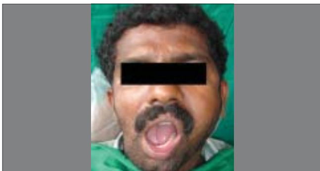
Figure 1: Extraoral view of patient

Based on the clinical situation, a cast-removable partial denture with a buccal guiding flange was planned.