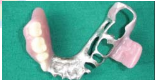
Figure 4: View of framework with guidance flange on left side