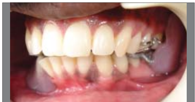
Figure 5: Definitive intraoral result