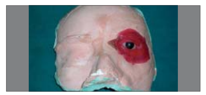
Figure 4: Wax pattern of the orbital prosthesis with the medial margin of acrylic resin base exposed