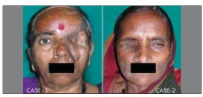
Figure 1: Frontal view of the face with orbital defect on the left side

Guttal, et al.: Spectacle retained silicone orbital prosthesis