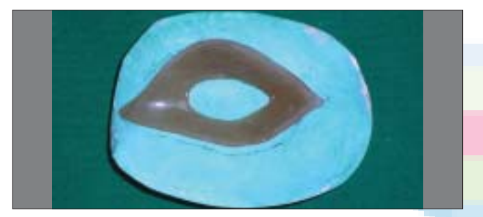
Figure 3: Fit of the acrylic resin base is checked on the cast