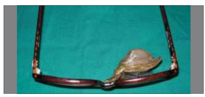
Figure 7: Silicone orbital prosthesis attached to the eyeglass frame