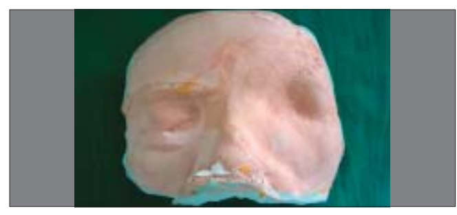
Figure 2: Facial moulage