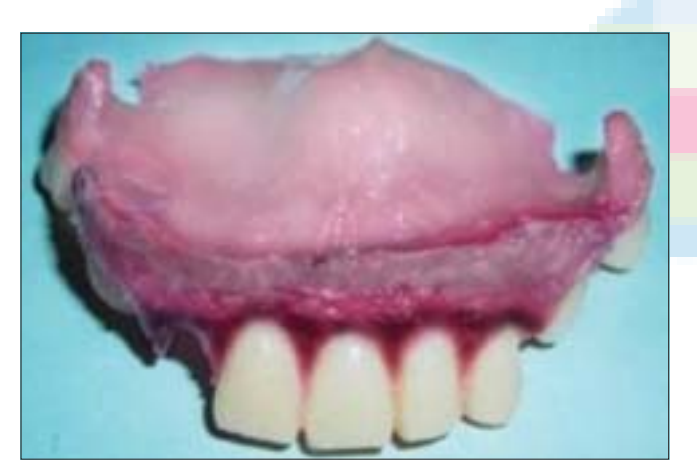
Figure 7: Patient 2 Prosthesis