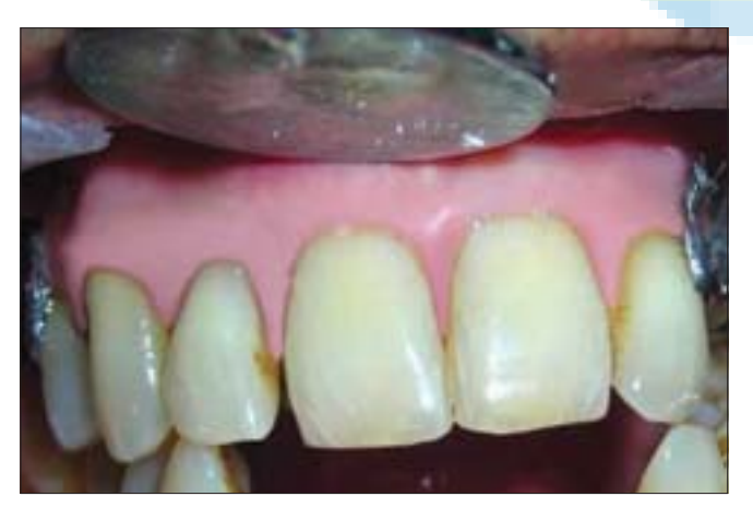
Figure 5: Patient 1 Postoperative 2

a final wax up was done. The pattern was invested and only the labial flange portion of the denture was replaced with soft liner.