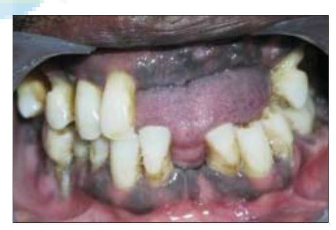
Figure 6: Patient 2 preoperative

stents. It maintains its resiliency for a period of five to six months. Hence the labial portion of the partial denture, along with the gingival prosthesis, should be replaced once in five months. The prosthesis was carefully retrieved from the mold, without distorting the flexible labial flange portion. Pigmentation was done with acrylic pigment colors selected according to the shade matching guide [Figure 7]. The prosthesis