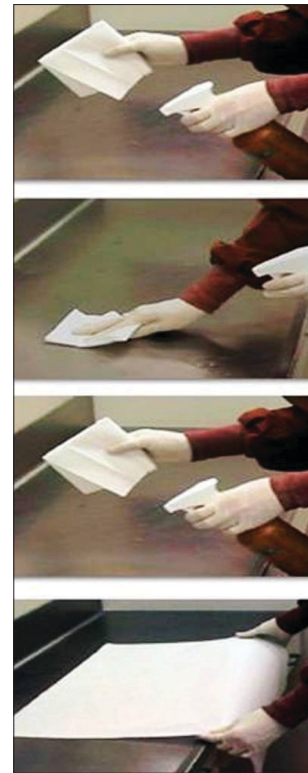
Figure 4: Spray - Wipe - Spray

or fabricating fixed or removable prosthesis, the type of restorative material used, long-term use and maintenance of a restoration should be considered. Nutritional recommendations for combating changes in the body composition are also advocated.