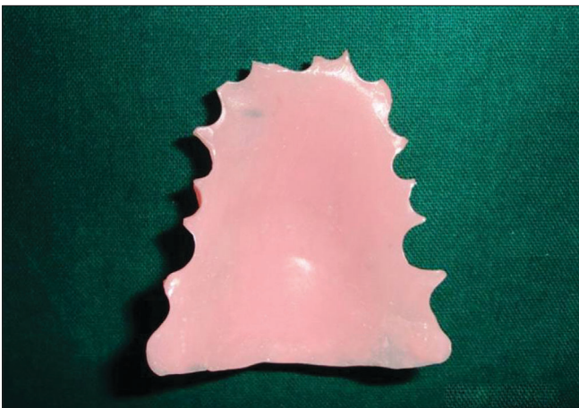
Figure 3: Palatal Plate

or fabricating fixed or removable prosthesis, the type of restorative material used, long-term use and maintenance of a restoration should be considered. Nutritional recommendations for combating changes in the body composition are also advocated.