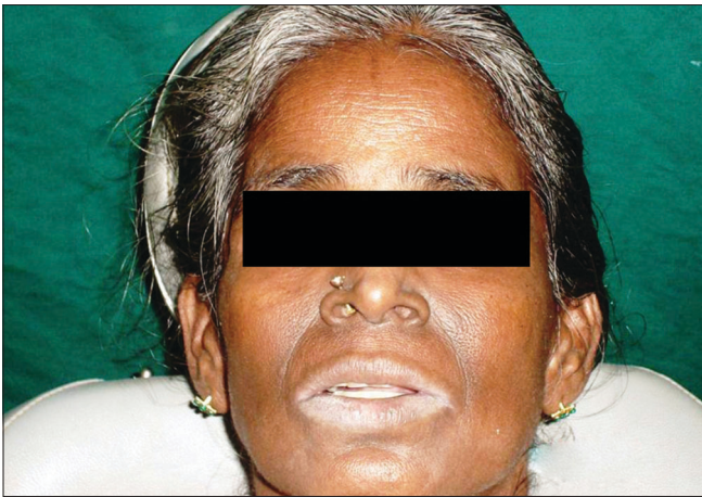
Figure 1: Extra -Oral Frontal