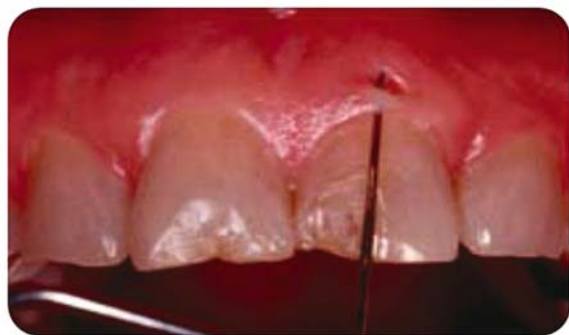
Thin gingival biotype

Thick periodontal biotype is fibrotic and resilient, making it resistant to surgical procedures with a tendency for pocket formation (as opposed to recession). Therefore, a thick biotype is more conducive for implant placement, resulting in favorable esthetic outcomes.