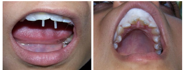
Fig. 2 Frontal ( left ) and occlusal ( right ) view of the placement of the glass fiber posts in the maxillary central incisors

proportion [7]. This implies that the maxillary central incisor should be approximately 60% wider than the lateral incisor, which in turn should be 60% wider than the mesial aspect of the canine, the distal aspect of the canine being obscured from the facial aspect. Further the lateral negative space, the area that appears between the anterior segment of the teeth and the corner of the mouth on smiling, should be in golden proportion to one half the width of this anterior segment. A grid was developed to help detect what is esthetically wrong in the anterior proportional relationship.