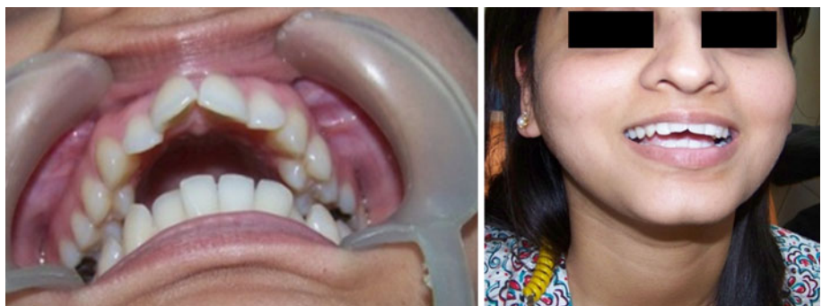
Fig. 1 Pre-treatment photographs: occlusal ( left ) and frontal ( right ) view of the crowded maxillary central incisors

One of the critical aspects of esthetic dentistry is creating geometric or mathematical proportions to relate the successive widths of the anterior teeth. The most harmonious recurrent tooth-to-tooth ratio was found in the golden