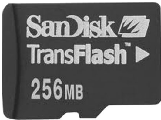
Fig. 1 Memory card