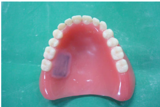
Fig. 8 Embedded memory card covered with pink acrylic

The patients were fully informed and gave their written consent to participate in the study. The study was presented in front of the Institutional Ethical Committee and the approval was taken.