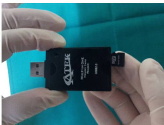
Fig. 3 Memory card inserted into card reader