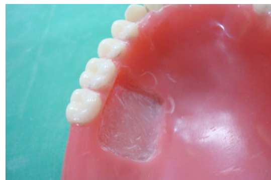
Fig. 5 Recess prepared in denture for memory card