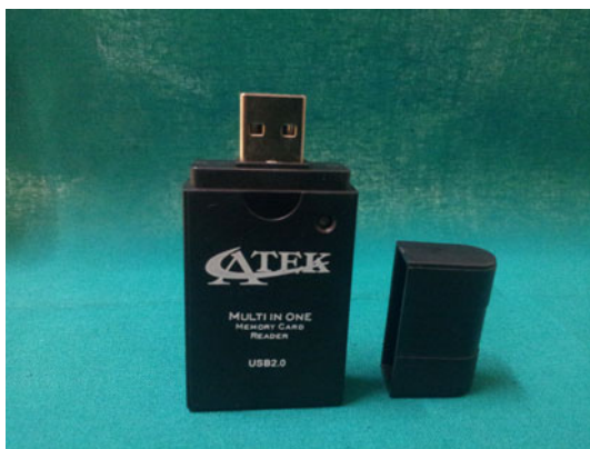
Fig. 2 Memory card reader