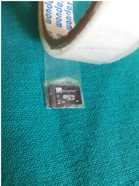
Fig. 7 Wrapping of card with cellophane