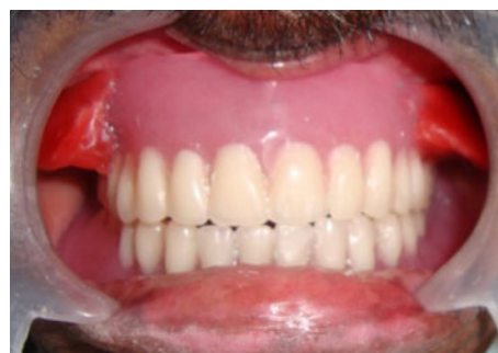
Fig. 2 Try in of acrylised denture with the cheek plumper

In the present case detachable plumper prosthesis were planned to reduce weight of the final prosthesis and to