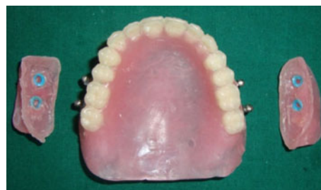
Fig. 3 Upper complete denture with detachable plumpers. Separators in plumpers allow a snap fit