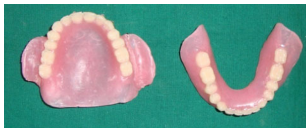
Fig. 4 Upper complete denture with detachable plumpers and lower complete denture