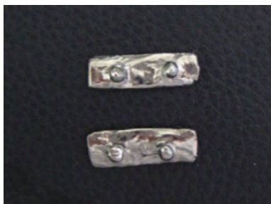
Fig. 1 Customised attachments

Acrylisation was done in conventional way. Upper denture was acrylised with the attachments placed on the buccal surface of denture. The finished and polished dentures were tried in the mouth. The waxed plumper prosthesis was repositioned over the attachment and required corrections were done (Fig. 2). Wax pattern of plumper was invested and acrylised. The acrylised plumpers were tried in the mouth and orthodontic separators were placed in the plumper part which corresponded to the attachments in the denture to get snap fit. For this, concavities were made in