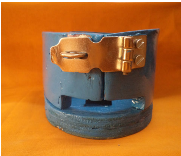
Fig. 2 Slot provision for impression tray handle

secondary impression or stock metal tray with primary impression rests.