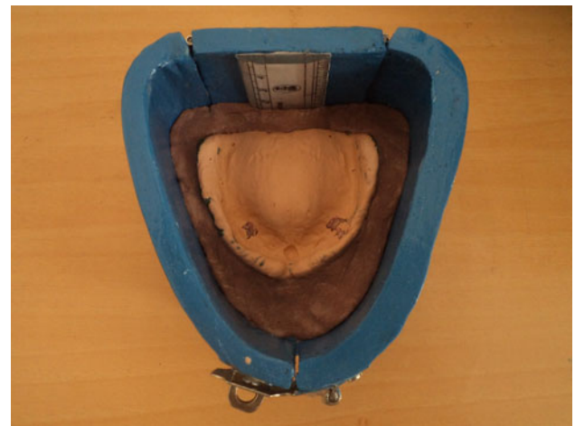
Fig. 4 Beaded and boxed secondary impression

(Yanran clay, Zhejiang, China) (Fig. 4). This appliance was made of autopolymerising resin (DPI-self cure; Dental Products of India, The Bombay Burmah Trading Corporation Ltd, Mumbai, India).