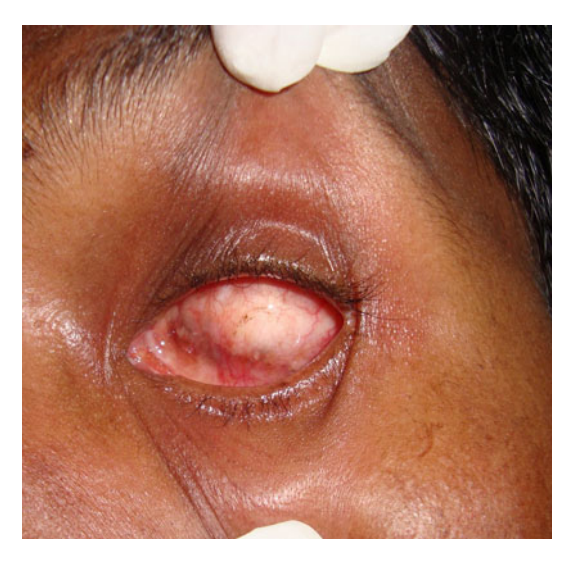
Fig. 5 Post operative healing