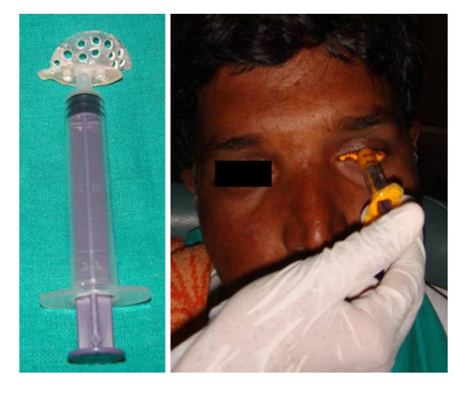
Fig. 6 Custom made ocular special tray and final elastomeric impression

Evisceration/enucleation of nonseeing, disfigured or painful eye leaves the patient with an empty or anophthalmic socket resulting in a volume depletion of