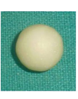
Fig. 4 Placement 16 mm intraocular poly(methyl methacrylate) ball implant