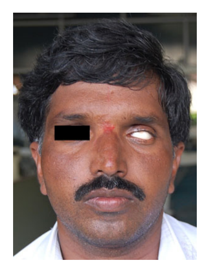
Fig. 7 Verification of the sclera blank

instructions were given and patient was advised for periodic check-up.