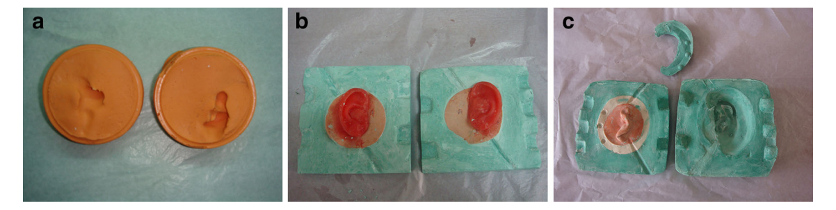
Fig. 2 a Impressions of the first part of the mould deformed ears. b Wax pattern adapted to first part of the mould. c Three part mould