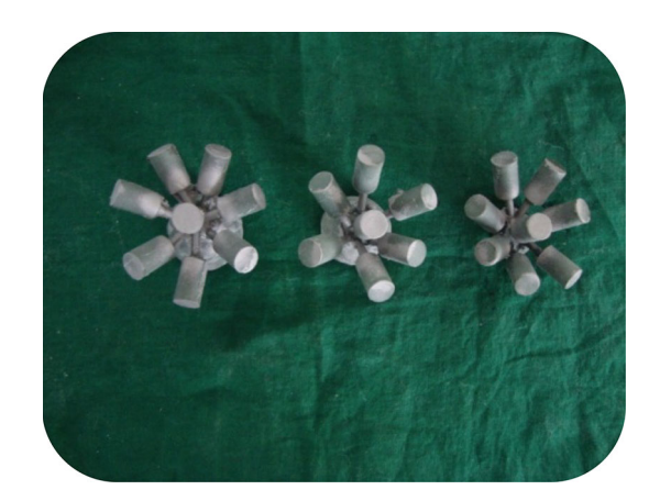
Fig. 4 Test alloy samples after casting

body porcelain (Ceramco3, Dentsply, USA). The cylindrical specimens were positioned in the lower half of the mold, with approximately half of its height above that. As the upper part of the mold, with circular form, presents a hole with an 10.4 mm diameter and 3.0 mm height, it provided a porcelain layer with similar dimensions for all specimens, that is, 1.2 \times 3.00 mm, with an area of 0.2827 cm<sup>2</sup> (Fig. 5).