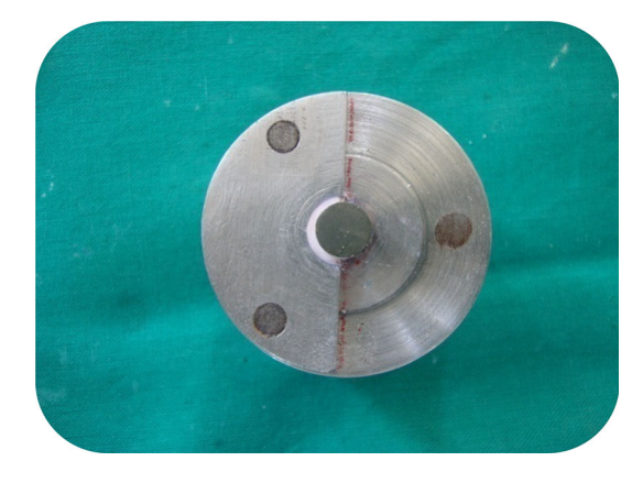
Fig. 5 Body porcelain application