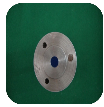
Fig. 2 Wax patterns of test alloy samples