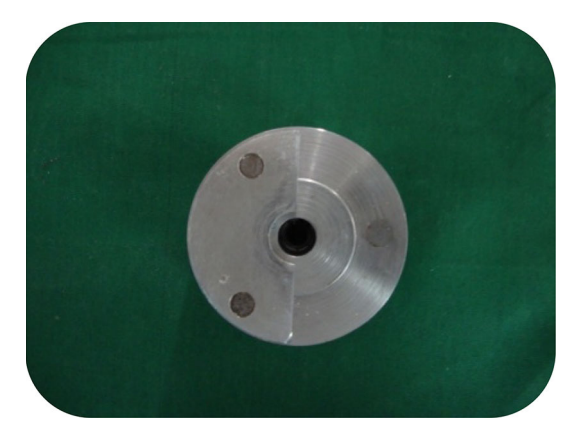
Fig. 1 Two portions of the stainless steel mold fitted together

1. For the study a stainless steel mold was fabricated which consisted of two parts; lower base with a vertical cylindrical perforation (13 mm high, 8 mm in diameter) and upper removable portion of semicircular