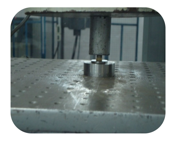
Fig. 6 Shear bond testing

body porcelain (Ceramco3, Dentsply, USA). The cylindrical specimens were positioned in the lower half of the mold, with approximately half of its height above that. As the upper part of the mold, with circular form, presents a hole with an 10.4 mm diameter and 3.0 mm height, it provided a porcelain layer with similar dimensions for all specimens, that is, 1.2 \times 3.00 mm, with an area of 0.2827 cm<sup>2</sup> (Fig. 5).