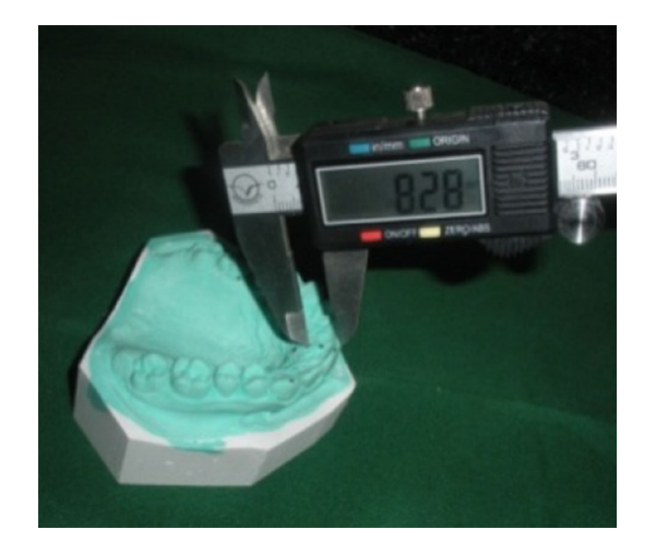
Fig. 2 Measurement with digital vernier caliper

Measurements of 0.5 mm or less were considered to be the center of the papilla. Lines those lie anterior and posterior to the 0.5 mm radius were taken as lines anterior to center of incisive papilla or as lines posterior to the center of the incisive papilla depending on where they lie.