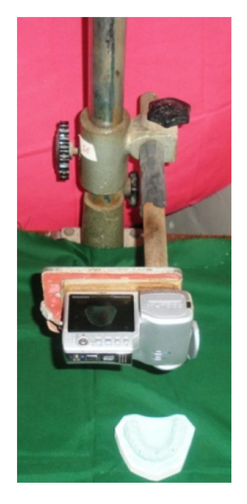
Fig. 3 Custom made device