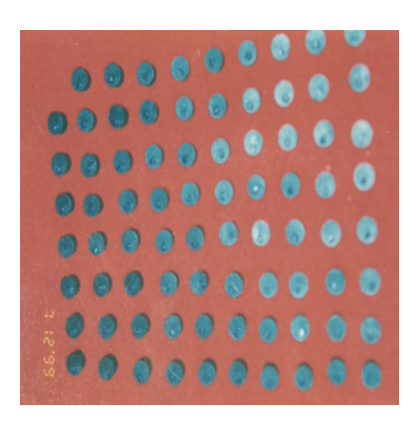
Fig. 4 Sprued wax patterns