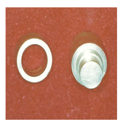
Fig. 1 Gum metal die and Sleeve