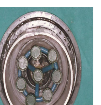
Fig. 5 Wax patterns before investing attached to sprue former

The frameworks were retrieved and sprues were cut from the castings. The castings were measured across the scribed lines. The measurements were tabulated (Tables 1, 2).