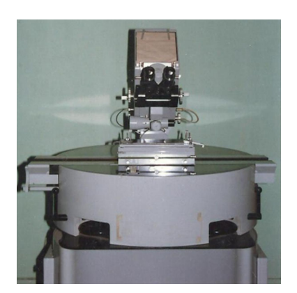
Fig. 3 Measuring microscope (Resolution 1 µm)

Two scribe lines were drawn on the wax patterns, one along the centre of the top of the wax pattern to be designated as occlusal surface and another along the long axis of the wax pattern to be designated as occlusogingival length for the purpose of this study; using a PKT carver and a measuring scale.