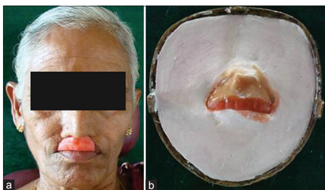
Figure 4: (a) The waxed lip prosthesis at the tryin stage. (b) The processed lip prosthesis