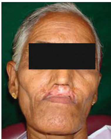
Figure 1: Patient with maxillary lip defect

At the recall appointment of the 1 st , 3 rd , and 6 th month, it was observed that there was no deformation of the prosthesis' margins related to the application of magnets and cleaning