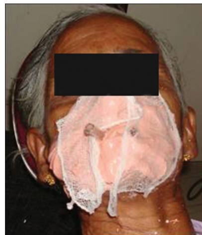
Figure 2: Impression of the lower half of the face