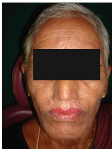
Figure 5: Insertion of Lip prosthesis retained with removable partial denture

agents. With improved material strength, it was easier for the patient to wear or remove the prosthesis.