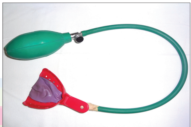
Figure 2: Customized balloon impression tray