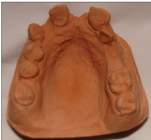
Figure 6: Maxillary cast