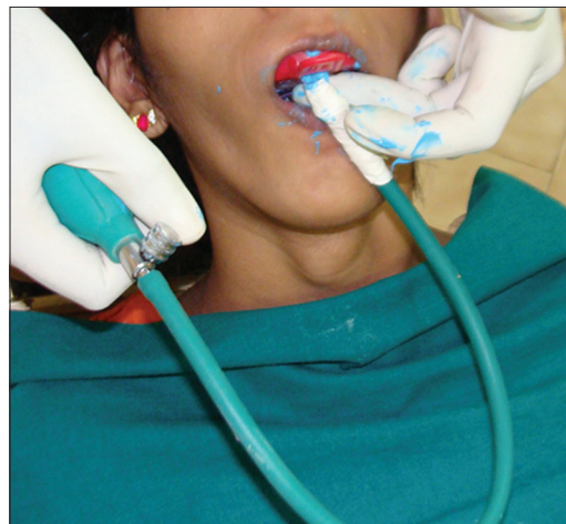
Figure 3: Impression recording with sphygmomanometer bulb