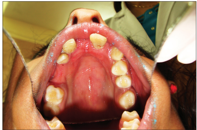
Figure 1: Intraoral photograph showing deep palate