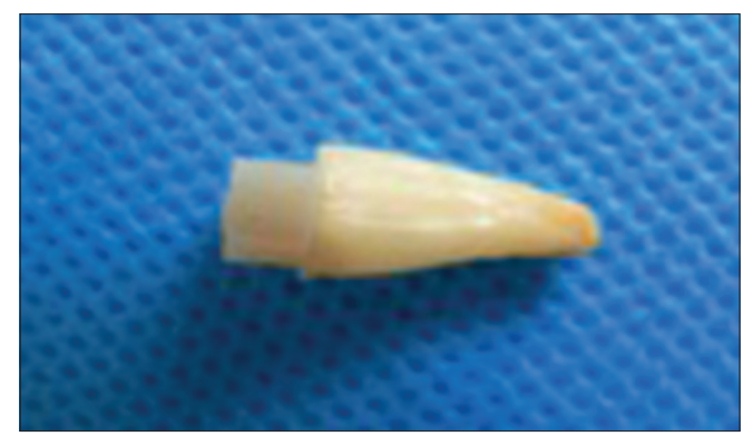
Figure 1: The core was made over the post

A cylindrical transparent mold, with a height of 5 mm and diameter of 6 mm, was used for core construction; as a result, each core covered 3 mm of the postoutside the canal and was 2 mm above the post [Figure 1]. After applying a bonding agent (Clearfil SE Bond, Kuraray, Japan) on the dentin surface, a little amount of composite resin (Filtek Z250 shade A3, 3M ESPE, St. Paul, USA)