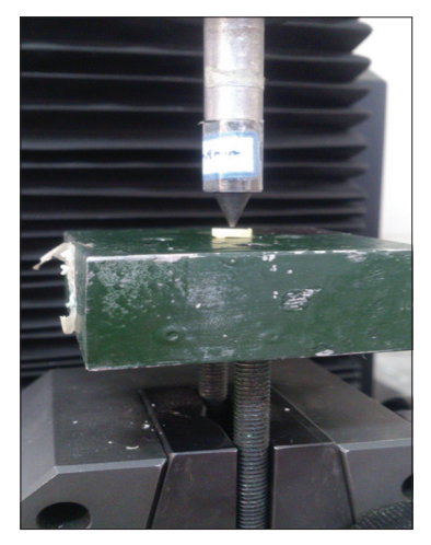
Figure 3: One of the test samples in the Universal testing machine