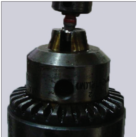
Figure 5: Pull-off test for determination of bonding strength