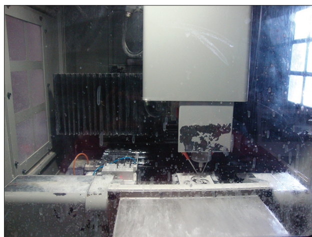
Figure 2: Metal milling of titanium blank for abutment copings

Copings of CAD/CAM, pressable ceramic and metal millings were divided into two halves. To maintain