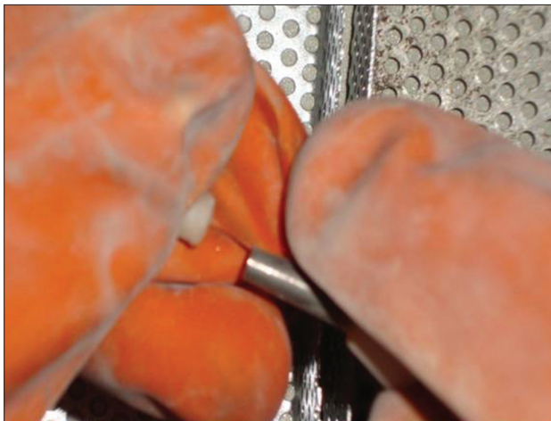
Figure 3: Surface conditioning done by air-abrasion with 50 \mu\text{m Al}_2\text{O}_3 at 2.5 bars pressure for 20 s

On intragroup comparison, results showed that pressable ceramic and milled metal group had the statistically significant difference ( P = 0.05 ) in conditioned and nonconditioned specimens [Table 2]. Bonding strength was highest for milled metal surface conditioned group. The least bonding strength was found for pressable nonconditioned group. The mean bond strength value with air abrasion specimens was higher. On intergroup comparisons, CAD/CAM, pressable, and milled metal surface conditioned specimens had statistically significant difference, and similar results were found for nonconditioned specimens [Table 3].