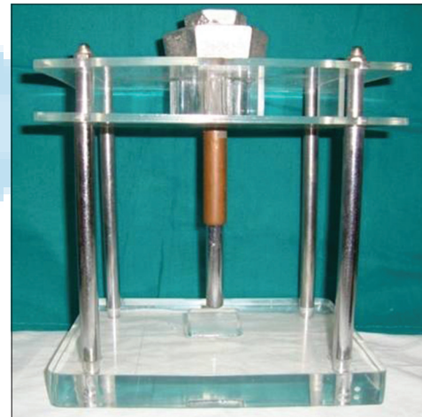
Figure 4: Alignment apparatus applying a weight of 750 g to the bonded specimens