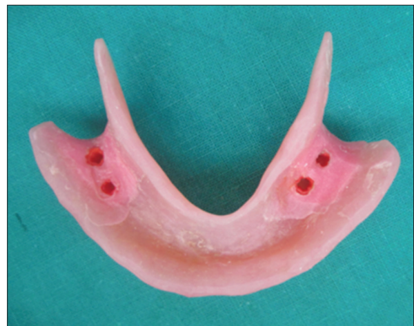
Figure 5: Tissue-fitting surface of the prosthesis showing embedded plastic sleeves