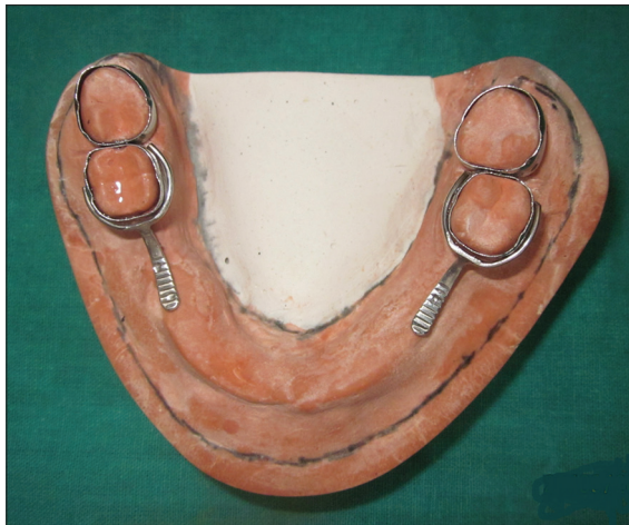
Figure 2: Molar bands adapted on the remaining molars and circumferential clasps adapted around the mesial molar bands

Occlusal load exerted by the long-span RPD is partly dissipated because of the flexible components of the attachment, such as molar bands, horizontal extension, and plastic sleeves. In other words, this custom attachment acts as a stress breaker. This technique is highly cost-effective as it uses inexpensive materials like straight die pins, molar bands, and prefabricated