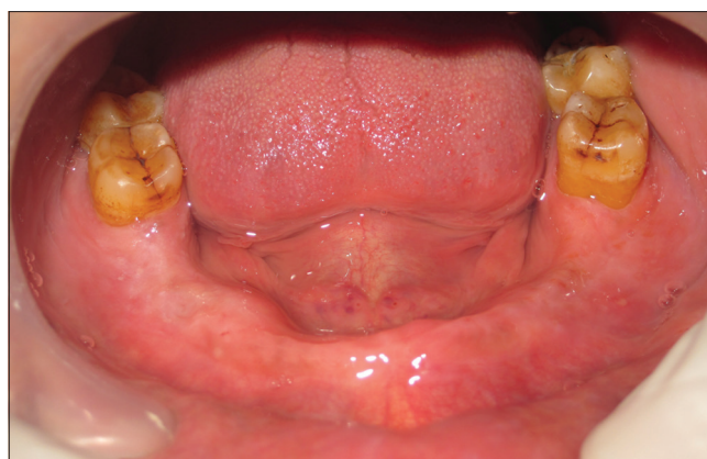
Figure 1: Intraoral view showing the mandibular long-span Kennedy class IV partially edentulous arch

The diagnostic impressions were made using irreversible hydrocolloid impression material (tropicalgin; Zhermack,