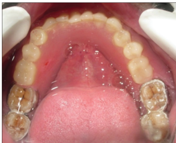
Figure 6: Intraoral view showing the prosthesis retained by custom attachment

clasps. No irreversible damage is caused to the teeth. Teeth separators were used rather than grinding the teeth to create space for inserting the molar bands.