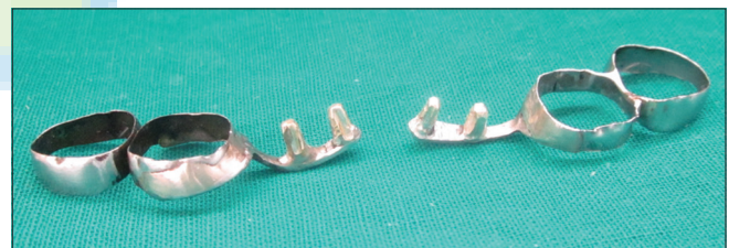
Figure 3: Splinted molar bands with the patrix part of the attachment