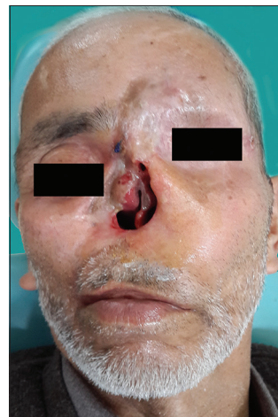
Figure 1: Pre-treatment photograph showing nasal defect

A separate scaffold was fabricated directly over the facial moulage with autopolymerizing resin by selectively utilizing