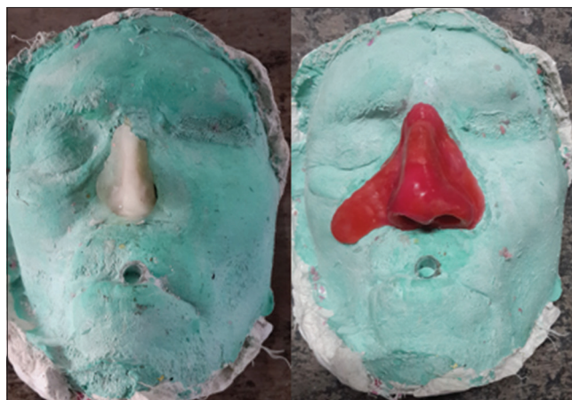
Figure 3: Wax pattern fabricated over acrylic scaffold