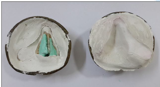
Figure 4: Flasking and dewaxing of wax pattern along with acrylic scaffold

Restoration of the facial defect is usually done by plastic and reconstructive surgeries. However, in certain cases presenting extensive loss of anatomic tissues, as in this case, prosthetic rehabilitation is definitely an alternative. [2] Two most commonly used materials for maxillofacial prosthesis are acrylic and silicones. Acrylic resin prostheses are cost effective, but they are inflexible and have esthetic limitations. Silicone is most commonly used for restoring facial defects. It is biocompatible, durable, lightweight, flexible, has the lifelike appearance, adequate working time and can be stained both intrinsically and extrinsically. Yet silicones have their own disadvantages