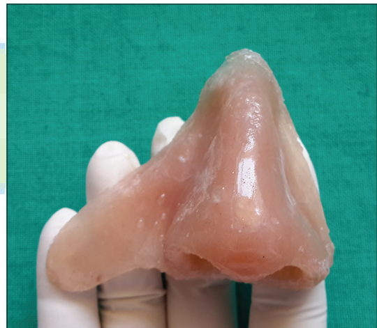
Figure 5: Finished nasal prosthesis