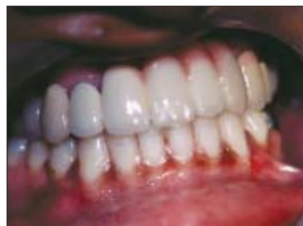
Figure 6: After cementation