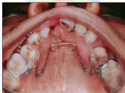
Figure 3: Photograph showing orthodontic treatment with fixed appliance, palatal quad helix fixed appliance