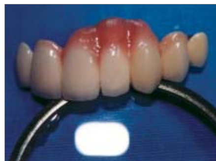
Figure 5: Finished fixed prosthesis with pink porcelain