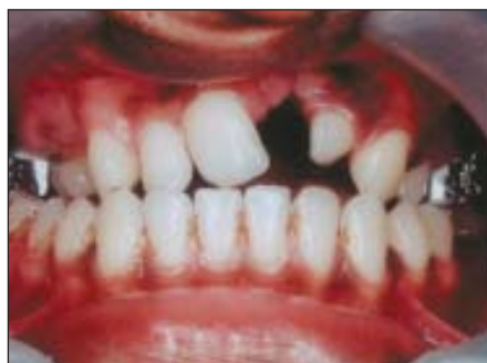
Figure 1: Before treatment. Cleft alveolus and cross bite can be seen

Distraction Osteogenesis is an innovative treatment option in craniofacial surgery. It was first used in orthopedic medicine in the early 1900s, but the current concepts evolved from the ideas of Dr. Gavriel Ilizarov, who practiced medicine in Kurgan, Siberia. Dr. Ilizarov, who had great understanding of the biophysiology of bone, developed techniques to move bone fragments in controlled vectors using a system of wires and fixed rings joined together with threaded rods and hinges. [2] It has also been established that in addition to bone formation, there are histogenetic