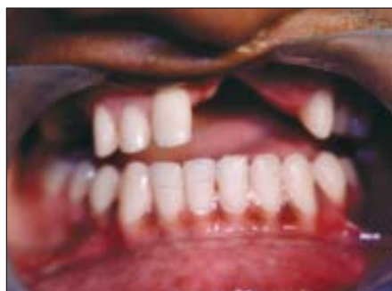
Figure 4: After crown preparations