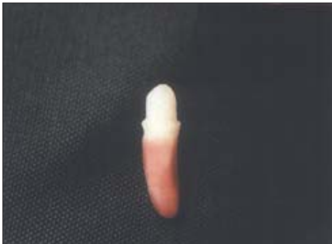
Figure 1: Simulated P. L. On Test Tooth

precision movable connector had a key and a keyway. The key was placed in the distal aspect of the anterior retainer while the keyway was placed in the mesial aspect of the pontic.