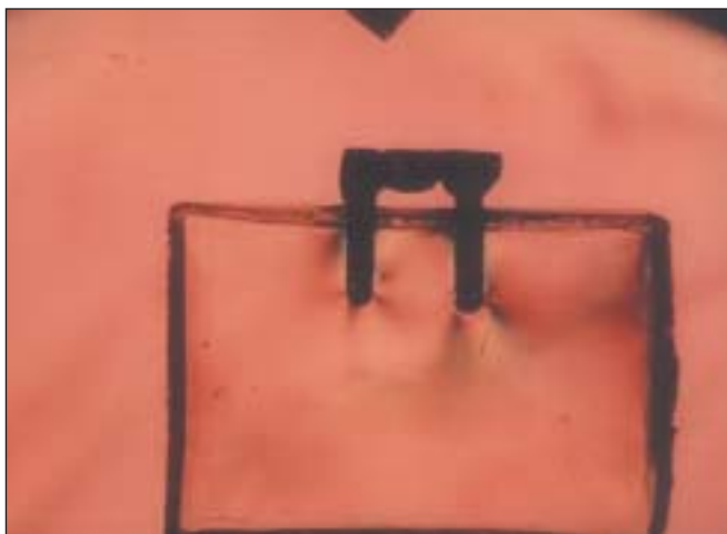
Figure 3: Simulated P.L. Test Tooth