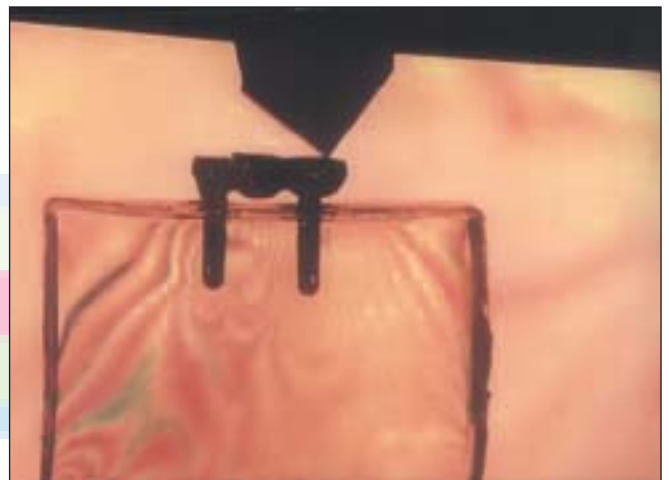
Figure 4b: Fringe Orders During Loading. Loading being carried out on the posterior abutment in totally implant supported situation, using rigid connector and 0% periodontal damage