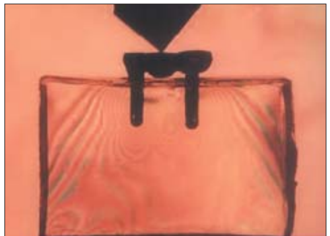
Figure 4c: Fringe Orders During Loading. Loading being carried out on the pontic in totally implant supported situation, using rigid connector and 0% periodontal damage