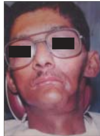
Figure 5: Patient before facial rehabilitation