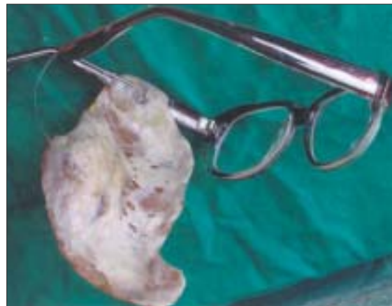
Figure 3: Prosthesis with retentive AIDS. (Tissue side)