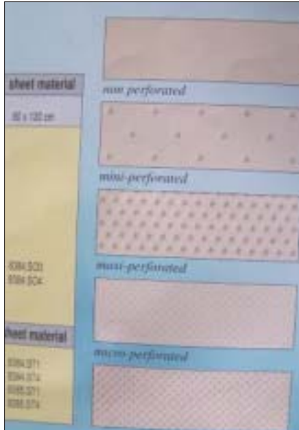
Figure 2: Perforated and nonperforated thermoplastics