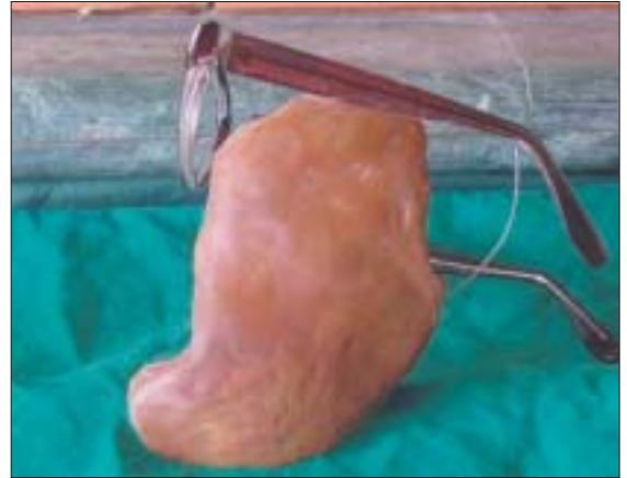
Figure 4: Prosthesis with retentive AIDS. (Facial side)