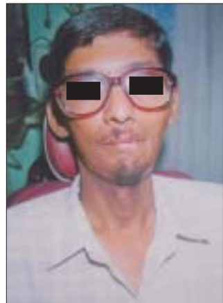
Figure 6: Patient after facial rehabilitation