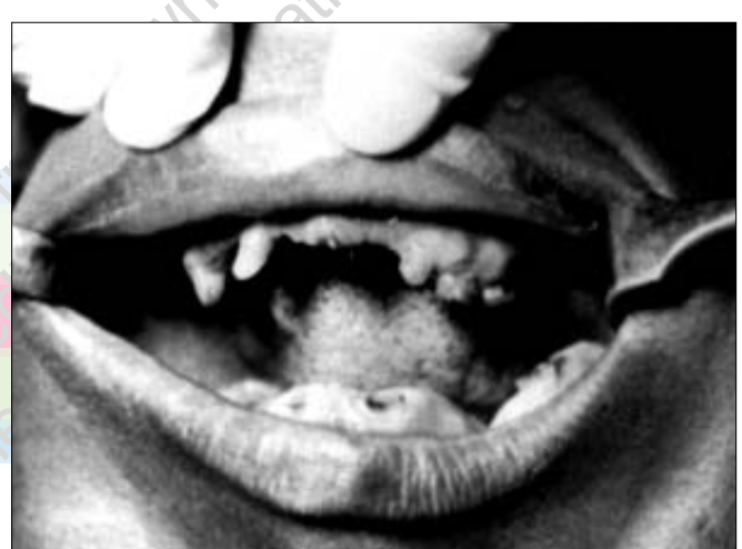
Figure 3: An intra-oral photograph to display the hypoplastic teeth and root remnants