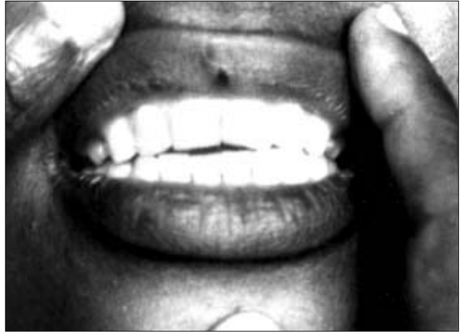
Figure 4: An intra-oral photograph showing the fabricated acrylic removable dentures won by the patient