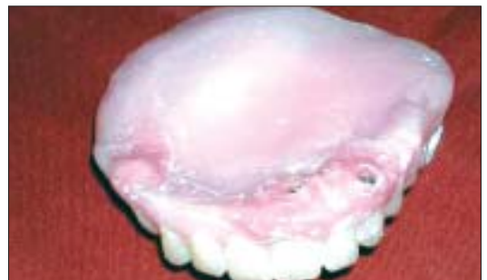
Figure 8: Dentures - tissue surface showing female component of the dallabona attachments