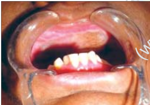
Figure 3: Postoperative - intra oral