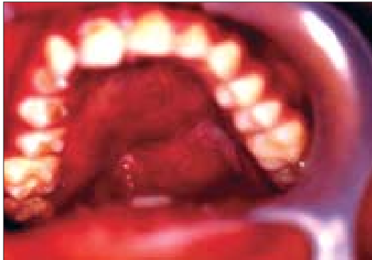
Figure 2: Intra oral - palatal lesion