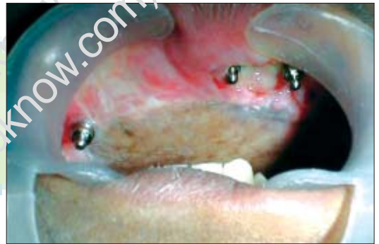
Figure 7: Postoperative view shows dallabona attachments