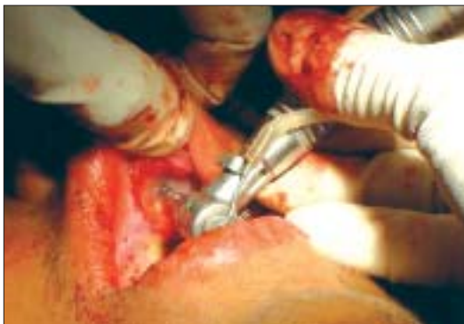
Figure 4: Surgical insertion of implant