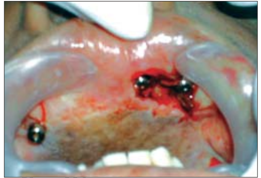
Figure 6: Second Stage - Implant surgery