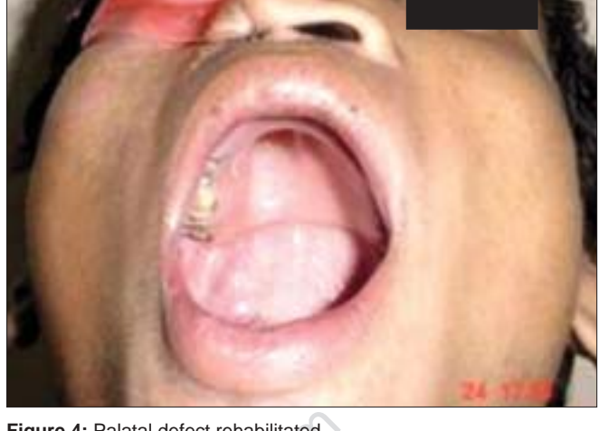
Figure 4: Palatal defect rehabilitated