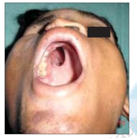
Figure 2: Palatal defect