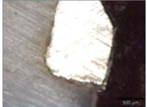
Figure 4: Evaluation of microleakage under a stereomicroscope