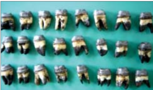
Figure 2: Samples after stain fixation