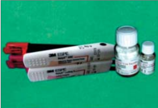
Figure 1: Luting agents used in the study