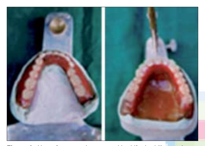
Figure 2: Upper/lower teeth set up with shifted midline and zero degree teeth