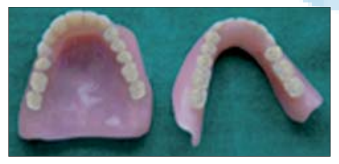
Figure 3: Finished prosthesis with adequate buccal sulcus support

were jerky and accurate recording of centric relation was difficult.