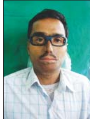
Figure 4: Postoperative view