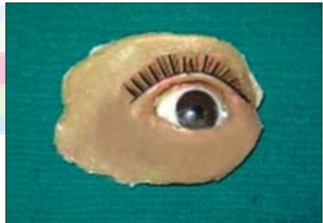
Figure 5: Finished orbital prosthesis