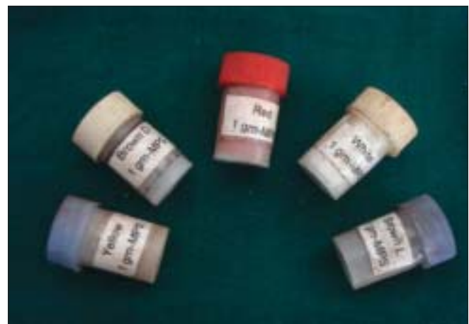
Figure 6: Intrinsic colors used