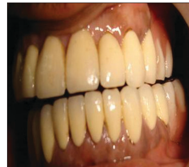
Figure 8: Canine-guided occlusion with disocclusion on both balancing and working side