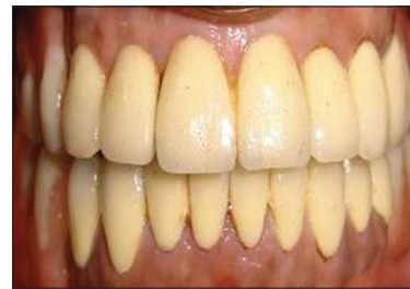
Figure 7: Patient with permanent restoration in centric occlusion