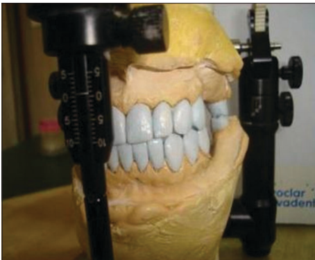
Figure 3: Diagnostic wax up on the semiadjustable articulator