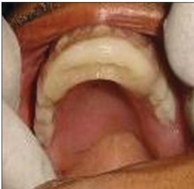
Figure 4: Patient with interocclusal splint