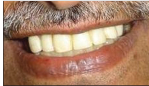
Figure 5: Patient with provisional restoration