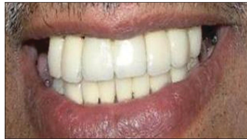
Figure 6: Patient with a bisque trial