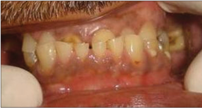
Figure 1: Intraoral view of the patient, showing occlusion wear and edge to edge bite