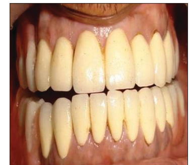
Figure 9: Disocclusion with protrusion