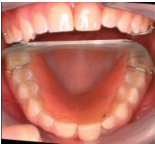
Figure 1: Removable space holder in place