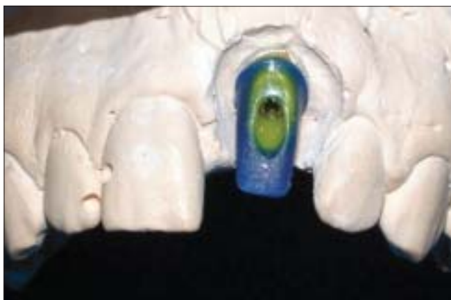
Figure 3: Friadent-AuroBase waxed

the definitive cast was poured in type V die stone. During abutment selection, even angled abutments could not correct the malposition. Treatment options for restoring the dentition to optimal function and esthetics were presented to the patient.