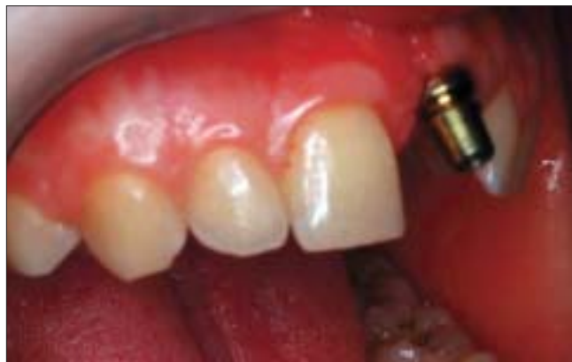
Figure 2: Position of implant can be seen clearly when transfer coping is seated