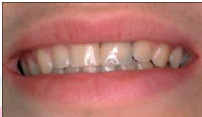
Figure 4: Finished ceramic crown

Gold custom abutment fabrication was planned using Friadent-AuroBase [Figure 3]. The Friadent-AuroBase consists of a gold alloy cast to abutment and waxing sleeve. It can be used to fabricate a one-piece restoration incorporating the abutment. The restoration was labially screw-retained to the implant. Prior to placement of the abutments and restorations, healing abutments were removed. The gold custom abutment was prepared and connected to the implant with a titanium screw tightened. The abutment was adjusted and sent back to the technician and ceramic restoration was finished. Metal reinforced ceramic crown was fabricated, coping was tried and margin integrity, occlusal relationship, and esthetics were verified [Figure 4]. The crown was finished, the screw-access opening was filled with cotton packing, and the restorations were cemented using provisional cement designed for cementation of implant restorations. The patient has been followed regularly for routine hygiene and evaluation of long-