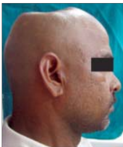
Figure 1: Preoperative profile view

Implants are of value in cases where the fractured piece of skull is short of fit in the defect because of intractable small pieces, or where the bone got infected. Autogenous bone grafts are not commonly indicated because of complications such as absorption and loss of contour. Alloplastic implant materials like metals,