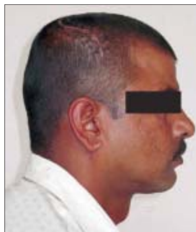
Figure 4; Postoperative profile view. *Zelgan -Dentsply, **Neel kamal -Kalabhai, ***Dentstone - Pankaj Enterprises, *Trevalon -Dentsply