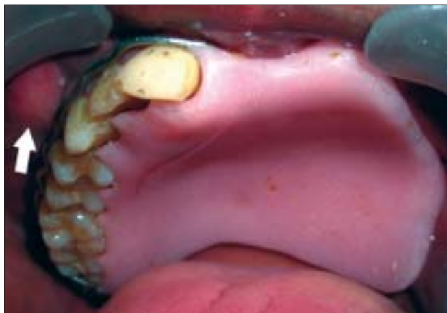
Figure 1: Arrow indicates recurrence of carcinoma on right buccal vestibule

the jaw, coil 'b' gets opened and vice versa. Coil 'a' and 'd' near individual attachments give freedom to the respective attachments. All four coils act simultaneously and permit jaw movements. Two such springs were prepared. [5]