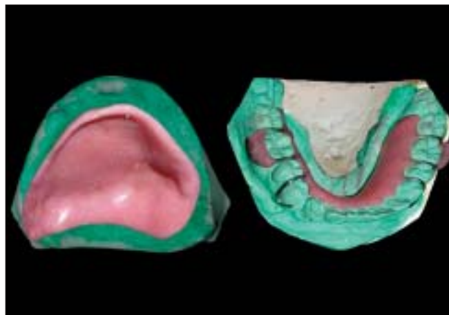
Figure 2: Scanned maxillary cast with obturator plate, mandibular retentive plate (note auto-polymerizing acrylic resin was applied to both Adams clasps)