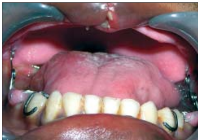
Figure 6: Spring-retained surgical obturator in mouth