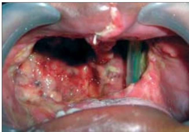
Figure 5: Intra-oral defect after total maxillectomy