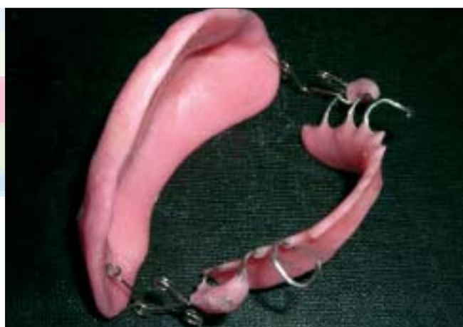
Figure 4: Complete appliance with springs attached on both sides