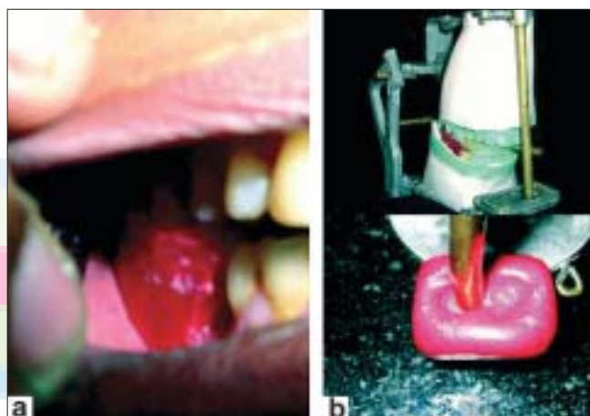
Figure 4: (a) Functionally generated chew-in record, (b) Articulation and hand manipulation to generate the custom anterior guide