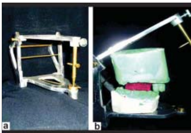
Figure 1: (a) A mean value articulator, (b) Inadequate clearance for the restorative model