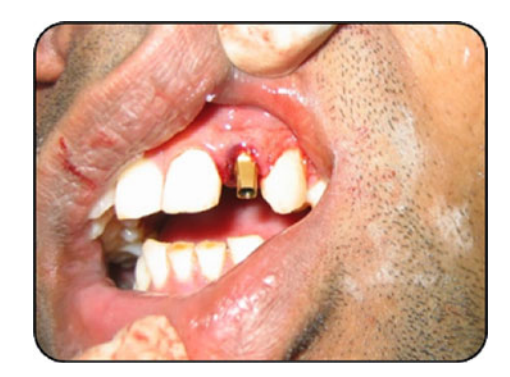
Fig. 3 Implant with abutment in place

received temporary acrylic crown bonded to the adjacent teeth with fiber-reinforced composite on the same day. The patient was recalled after 4 months for the prosthetic procedures and was given porcelain fused to metal crown over the implant. The patient was recalled for prophylaxis and follow up every year (Figs. 4b, 5). The clinical and radiographic appearances at 5 years show good esthetics, osseointegration and maintenance of bone around the implant (Figs. 4c and 6).