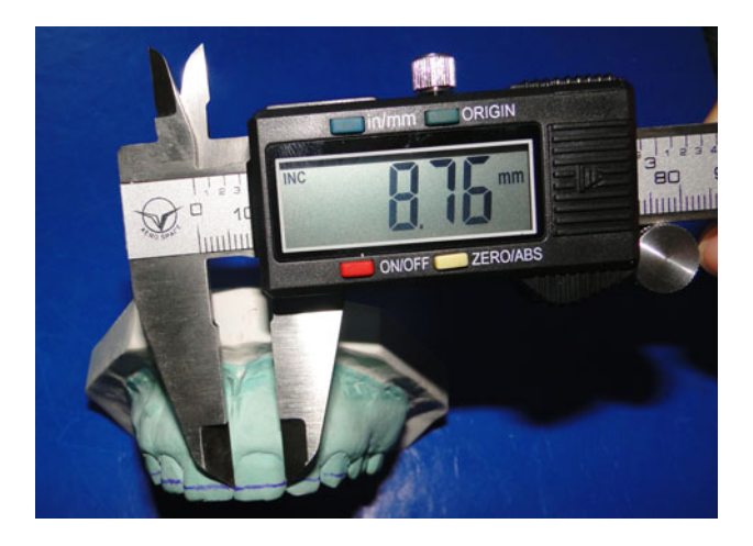
Fig. 2 Measurement of maxillary teeth using Vernier caliper

combined mean mesiodistal width of male and female subjects on right, left side maxilla and mandible is 0.42 mm, 0.44 mm and 0.45 mm, 0.41 mm respectively as shown in Table 4. These readings signify that the mean mesiodistal widths are larger for male subjects than female subjects and that mean mesiodistal width on right side is greater than left side except the mean mesiodistal width for right and left mandibular canine with a difference of -0.02 mm.