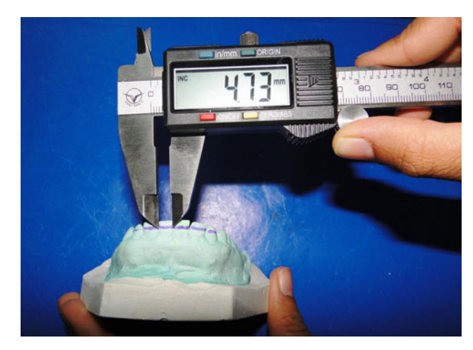
Fig. 3 Measurement of mandibular teeth using Vernier caliper

The percent of similar combined mean mesiodistal width of maxillary anterior teeth right and left side in male and female subjects is 7.17 and 9.56% and in mandible is 9.56 and 11.95%, respectively, as shown in Table 5 (Fig. 4). The maximum number of similar right and left teeth in male subjects is maxillary canine which amounts to