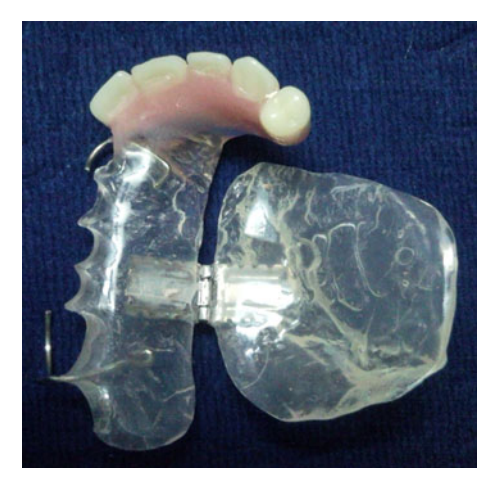
Fig. 6 Unfolded view foldable obturator