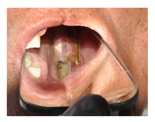
Fig. 2 Pre-treatment intra-oral view