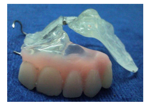
Fig. 8 Labial view foldable obturator

The patient was trained to fold the obturator, insert into the mouth and unfold to place it in position. He was also trained to fold it before removing the prosthesis from his mouth. Post insertion instructions were given. The patient was advised: (i) To remove the prosthesis from his mouth before bed time and to keep it in a box containing denture