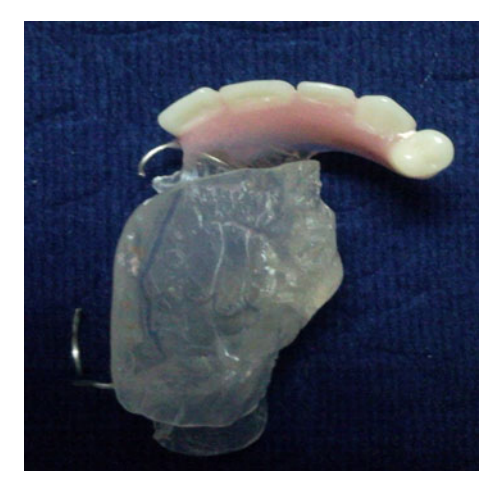
Fig. 7 Folded view foldable obturator