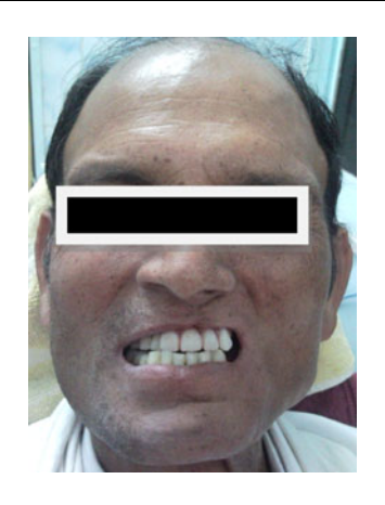
Fig. 4 Try-in of foldable obturator