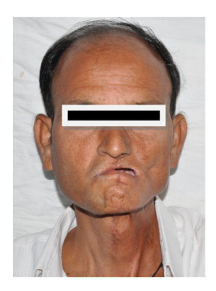
Fig. 1 Pre-treatment extra-oral view