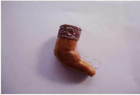
Fig. 5 Finger prosthesis showing movement