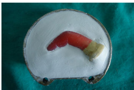
Fig. 2 Wax pattern of the finger which was flaked