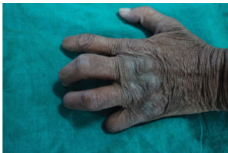
Fig. 1 Pre-operative photograph of hand with finger defect