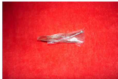
Fig. 3 Tick-tock hair pin wrapped in the clear adhesive tape in an open ( unlocked ) position