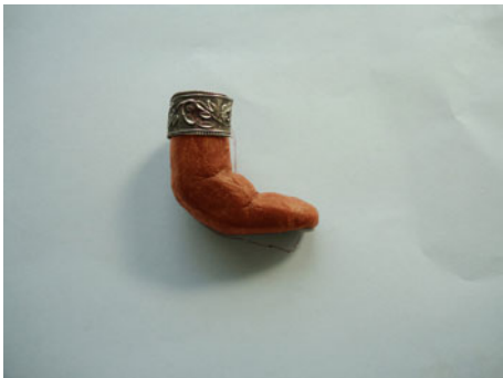
Fig. 6 Finger prosthesis showing movement. ( Flex )