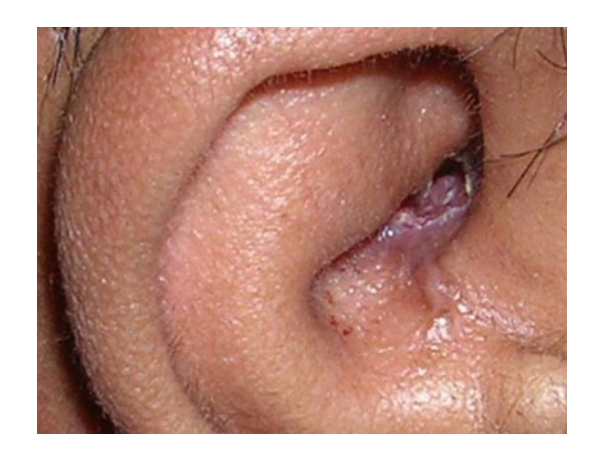
Fig. 12 Post operative view of right ear with surgically created external auditory canal after 3 weeks of surgery

surgery is worthwhile if proper patient selection is made by use of stringent audiological and radiological criteria and if state of the art surgery is performed [6]. Meatal restenosis and infection are the most frequent post surgical complications which lead to the failure.