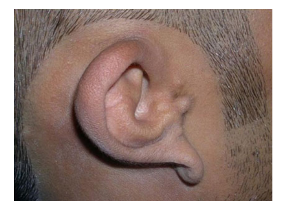
Fig. 1 Pre-operative view of patient's right ear without external auditory meatus