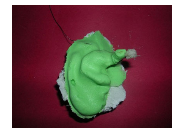
Fig. 4 Impression of the right ear with a plaster supporting base

carried out (Fig. 8). The stent was kept in water for 24 h for further reducing the monomer content and kept immersed in 2 % glutaraldehyde solution before using it.