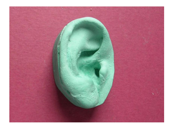
Fig. 5 Cast fabricated by pouring the impression