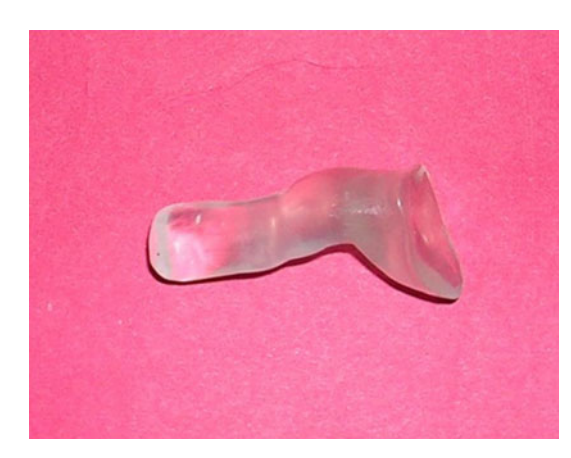
Fig. 8 Photograph of the ear stent made in clear acrylic material

recorded by protruding the lower jaw by 3–4 mm anteriorly. The casts were articulated using the protrusive record. Occlusal stent was fabricated (Fig. 11). Patient was instructed to wear the occlusal stent during the healing phase.