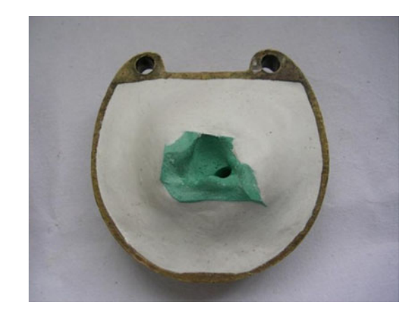
Fig. 7 Photograph of flask after the dewaxing procedure

recorded by protruding the lower jaw by 3–4 mm anteriorly. The casts were articulated using the protrusive record. Occlusal stent was fabricated (Fig. 11). Patient was instructed to wear the occlusal stent during the healing phase.