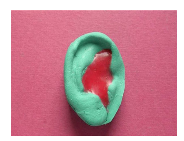
Fig. 6 Wax poured in the ear canal to make a pattern