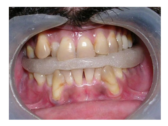
Fig. 11 Occlusal stent in situ