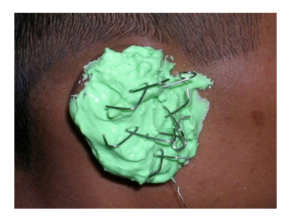
Fig. 3 Attachment of metal wire clips on the impression to support the plaster base

was injected into the ear canal using a syringe. Adhesive clips were attached to the impression material from outside to hold the plaster base for the impression (Fig. 3). A mix of plaster of paris was poured on it to support the impression. Once the material was set, the impression was removed from the ear (Fig. 4) and poured with dental stone to fabricate a cast (Fig. 5). The ear canal of the model was enlarged using acrylic trimming burs mounted on a straight hand piece. The procedure of widening the canal was carried out slowly and carefully so that the anatomy of the original canal in the model was maintained. The reason for widening the ear canal on the model was to fabricate a stent of slightly larger diameter that can compensate for the amount of tissue shrinkage which would happen during tissue healing. Modelling wax was melted and poured into the canal on the model (Fig. 6). The model was flasked and dewaxed (Fig. 7). The flask was packed with a clear acrylic resin and acrylization was done using a long curing cycle to reduce the residual methymethacrylate content [5]. Once the process of acrylization was complete the deflasking was done and finishing and polishing of the acrylic stent was