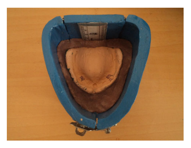
Fig. 4 Beaded and boxed secondary impression

(Yanran clay, Zhejiang, China) (Fig. 4). This appliance was made of autopolymerising resin (DPI-self cure; Dental Products of India, The Bombay Burmah Trading Corporation Ltd, Mumbai, India).