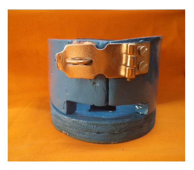
Fig. 2 Slot provision for impression tray handle

secondary impression or stock metal tray with primary impression rests.