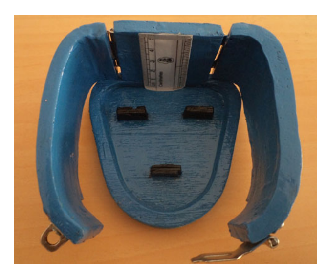
Fig. 1 Beading and boxing appliance with elevated studs