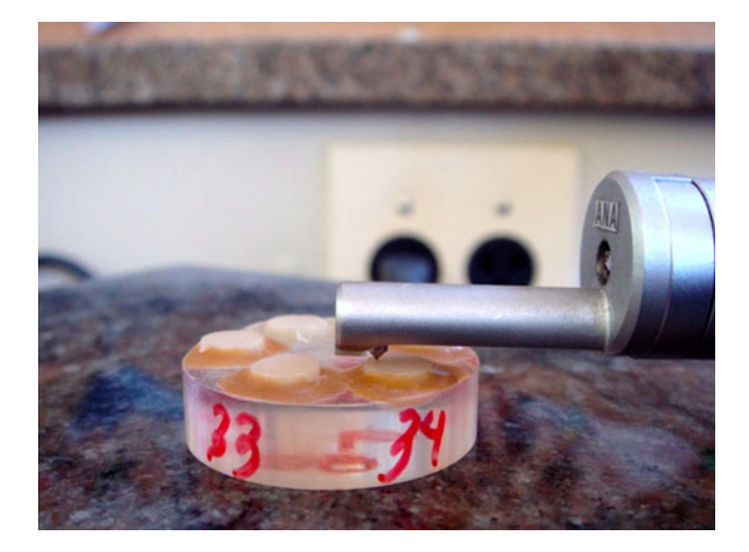
Fig. 2 Initial roughness measurement

the arithmetic mean (Ra) between the peaks and depressions traveled by the active tip of the device, in which the measurement run was 1.25 mm with a wavelength of 0.25 mm. The mean obtained for each test specimen corresponded to three readings, one performed in the direction of the test specimen diameter, the others perpendicular and in the oblique direction of the first reading.