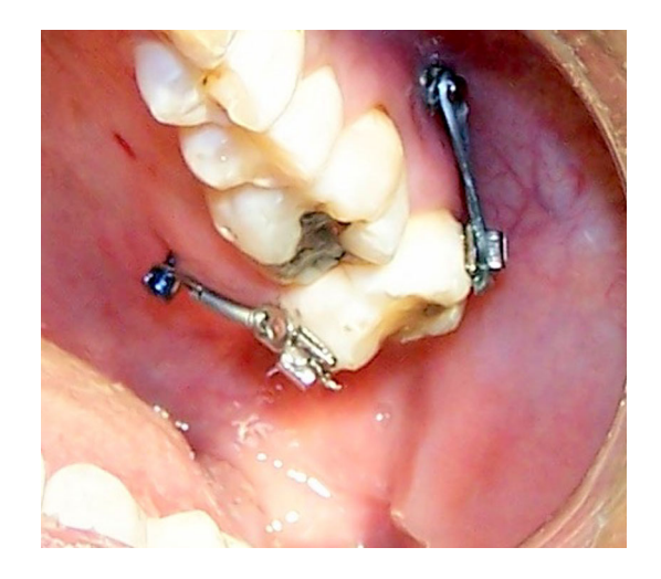
Fig. 6 Palatal and labial microimplant loaded for intrusion