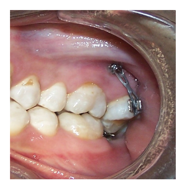
Fig. 4 Case report 2-supraerupted maxillary second molar

osseointegrated for another 3 months. After the maxillary second molar (27) was in functional occlusal plane the mandibular left second molar (37) implant received the final prosthesis (Fig. 7).