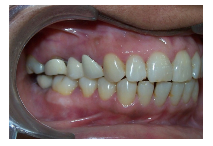
Fig. 3 Posttreatment occlusion