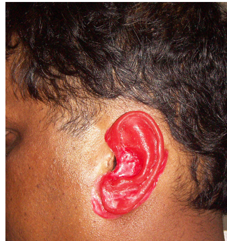
Fig. 4 Completed wax pattern