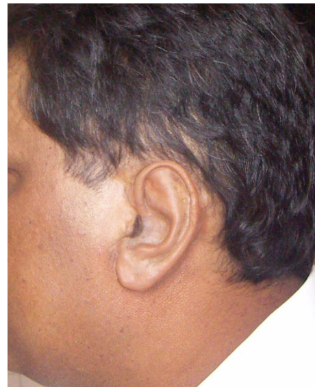
Fig. 5 Finished prosthesis