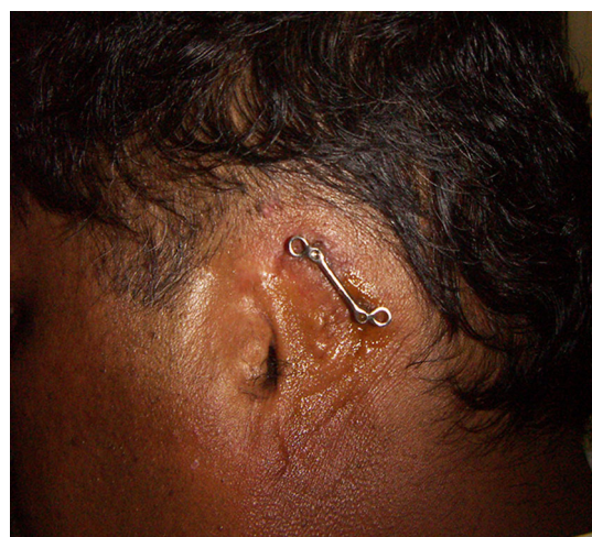
Fig. 2 Modified Hader-bar system with two loops

The bar is supported on two implants placed at 15 mm distance and it has a total length (including the loops) of 27 mm.