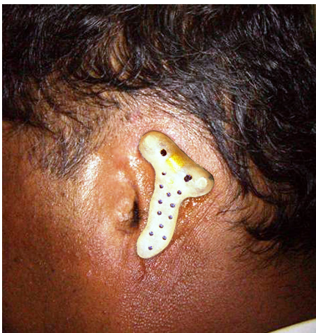
Fig. 3 Super structure tried on patient