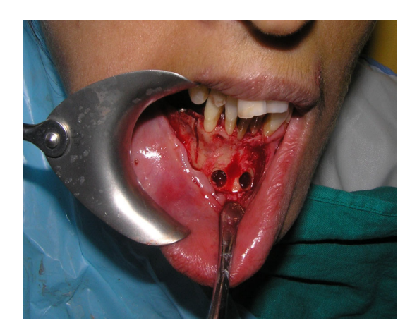
Fig. 6 Autologous graft harvested from symphysis region