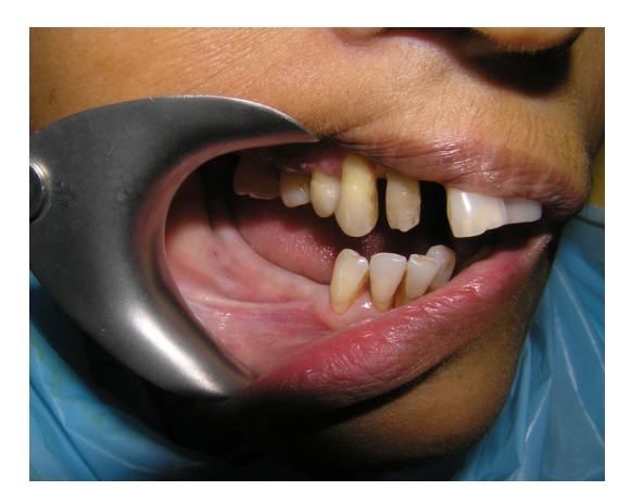
A 24 years young female approach for replacement of missing lower left second premolar and first molar. The