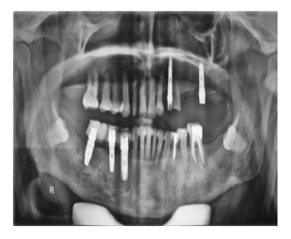
Fig. 8 Post-op orthopentomogram showing stable implants in #28, #29 & #30 region with splinted crowns

placement. So ridge splitting was planned under local anaesthesia. A full thickness mucoperiosteal flap was elevated from first premolar to second molar. Midcreastal osteotomy along with vertical bony cuts on mesial and