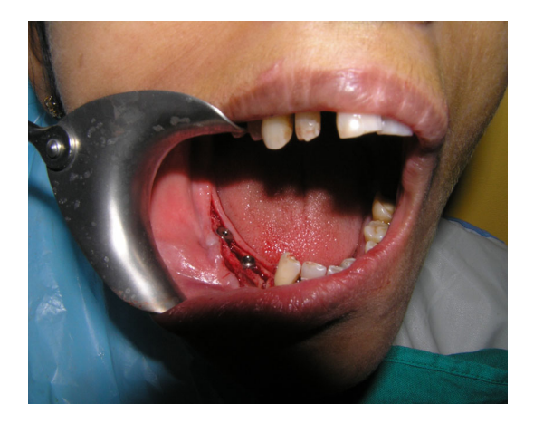
Fig. 5 Implants placed in the splitted ridge in #28, #29 & #30 region