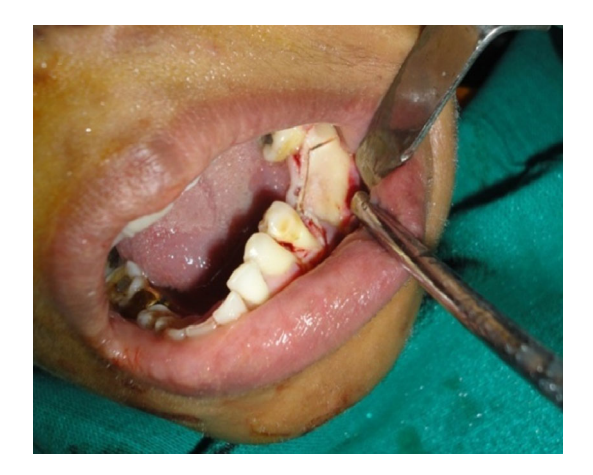
Fig. 9 Ridge splitting with midcrestal incision and mesial and distal vertical osteotomy cuts

The ridge split procedure represents one form of agumentation technique for narrow rigdes. The procedure can be considered for simultaneous placement of implants in addition to ridge expansion, thus reducing the overall time for implant therapy. Ridge splitting for root-form implant placement was developed in the 1970s by Dr. Hilt Tatum [3]. Tatum developed specific instruments including