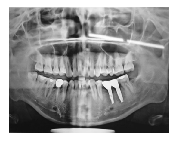
Fig. 10 Post-op orthopentogram showing stable implanted with splinted PFM crowns n #19 & #20 region

tapered channel formers and D-shaped osteotomes toexpand the resorbed residual ridge. Summers [4] later revived the interest in this technique; he reported that in 143 maxillary implants placed using the osteotome technique, only 5 failed (96 % implant survival). In 1992, Simion et al. [5] introduced a split-crest bone-manipulation technique by means of provoking a longitudinal greenstick fracture at the top of the bone that would split the atrophic crest in two parts. In 1994, Scipioni et al. [6] presented the clinical results of an edentulous ridge expansion technique. They placed 329 implants in 170 patients with success rate of 98.8 %. Sethi and Kaus [7] placed 449 implants in 150 patients in thin maxillary ridges of adequate height and comprising 2 separate cortical plates with intervening cancellous bone and observed them for a period of up to 93 months. A 97 % implant survival rate after a 5-year observation period was found.