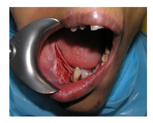
Fig. 4 Midcrestal osteotomy with anterior releasing vertical bony cut

teeth have been extracted 3 year ago for grossly carious non restorable reason. The patient has been planned for implant placement. Clinical examination revealed very thin ridge width with adequate bone height for implant