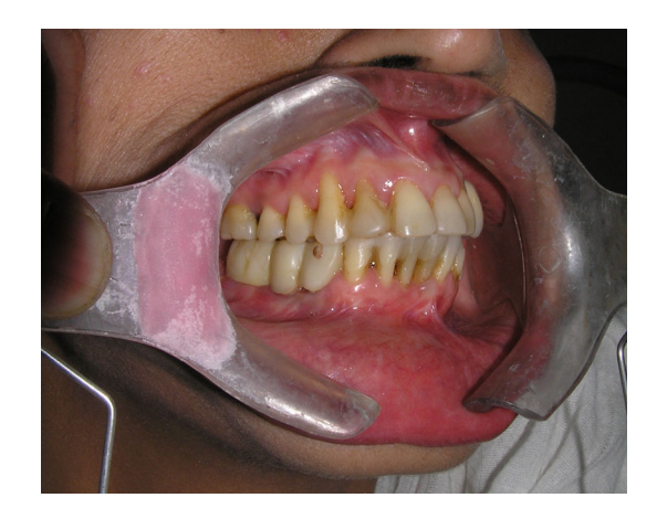
Fig. 7 Implant retained composite splinted crown in #28, #29 & #30 region

placement. So ridge splitting was planned under local anaesthesia. A full thickness mucoperiosteal flap was elevated from first premolar to second molar. Midcreastal osteotomy along with vertical bony cuts on mesial and