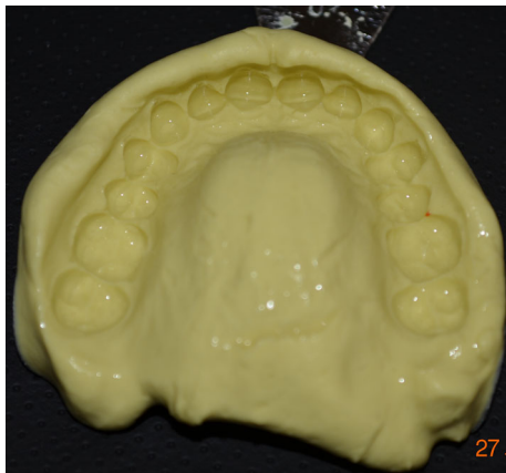
Fig. 1 Alginate impression of the subject