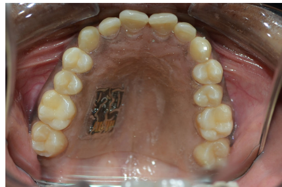
Fig. 6 Palatal identity appliance in the subjects oral cavity

Radiographic methods require specialized equipment and ante mortem data and the results may not be extremely accurate leading to inferences with varying degrees of doubt. Genotype matching with personal articles can be very time consuming. This palatal identity appliance can be an effective tool in identifying the dead mining personale. The mining personale entering the mines should be instructed to wear this appliance and suitable oral hygiene