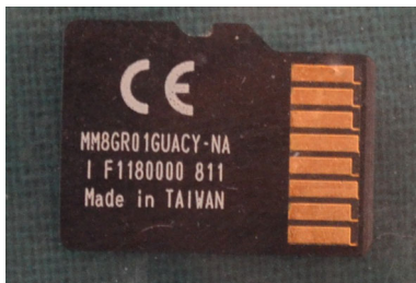
Fig. 3 Insulated memory chip

Identification of the dead is absolutely essential for civil, legal and social purposes. Common methods of identification of decomposing dead bodies are by dental records [1], palatine rugae records genotyping with personal articles [2], radiographic skull image superimposition [3, 4], radiographic super imposition over ante mortem photographs, and radiologic assessment for evidence of fracture treatment with bone screws and plates if any, peculiar osseous abnormality [5] and dactyloscopy. The dental records and palatine rugae [6] records require ante mortem records and data to verify the postmortem findings and establish identity.