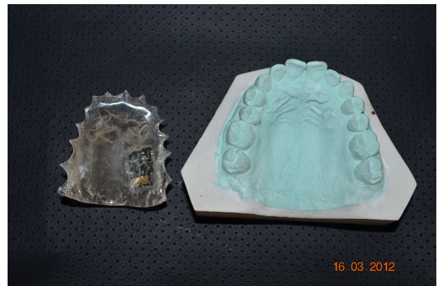
Fig. 5 Palatal identity appliance