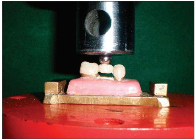
Figure 6: Testing of fracture resistance of the sample