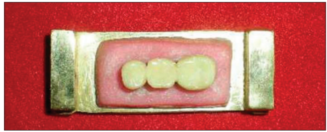
Figure 5: Interim fixed partial denture sample on the master die

Glass fibers were tested as reinforcement for denture base PMMA as early as the 1960s. Since then, many studies investigated the strength of the GF-PMMA composite. [17] There is evidence from dynamic in-vitro tests that GF reinforcement increased fatigue resistance of dental appliance up to 100 times compared with fatigue resistance of an unreinforced restoration. [18] The GF used in the study (everStick ® ) are silanized E-GF preimpregnated with porous polymer and is formed of a large number of unidirectional GF. Results of the study suggested that placement of fibers in the occlusal third of the pontic region of the three-unit FPD sample showed the best fracture resistance values. Geerts, Overturf and Oberholzer [19] compared the fracture resistance of a PMMA resin and a BAC resin reinforced with stainless steel wire, glass fiber and polyethylene fiber. They concluded that