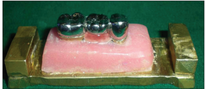
Figure 3: Cast metal fixed partial denture with wax block out on the master die