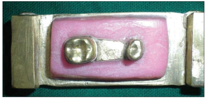
Figure 2: Brass master die

Group 2: The GF was precut to 10 mm (required dimension between the connectors). This fiber was wetted with monomer for 10 s. The fiber reinforcement was placed at the middle third portion of the pontic of the die between the connectors and stabilized with