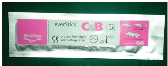
Figure 4: Everstick glass fiber

the resin mixture on both its end with the one-third part of the resin mix. The resin was then allowed to set partially. Then the second part of the resin mixed and added to fill the impression. Then the impression tray was inverted over the master die with fibers in place. Rest of the procedure was same as in Group 1. This resulted in the interim FPD sample with GF located in the middle third of the pontic