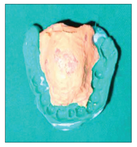
Figure 7: Reassembled final impressions extraorally to obtain a single piece full arch impression