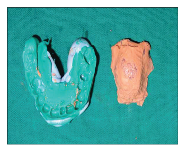
Figure 6: Disassembled final impressions