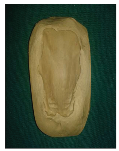
Figure 2: Preliminary cast of palate for fabricating custom tray