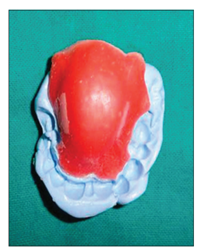
Figure 5: Reassembled preliminary impression extraorally

This disassembled impression will be assembled extraorally to obtain a single piece full arch impression [Figure 7].