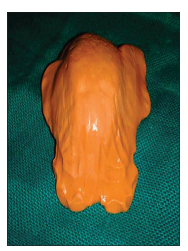
Figure 1: Impression of palate with impression compound