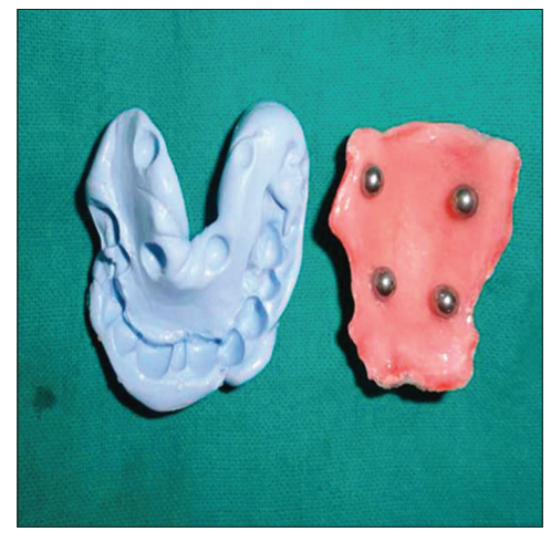
Figure 4: Disassembled preliminary impression