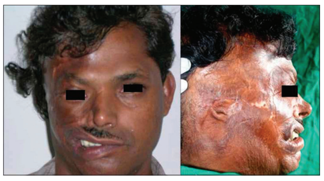
Figure 1: Preoperative frontal and profile view of the patient

Using this mold of the left ear, a wax pattern of the right ear was carved out as a mirror image of the opposite side using modeling wax (Hindustan Dental Products, Hyderabad, India) [Figure 4].