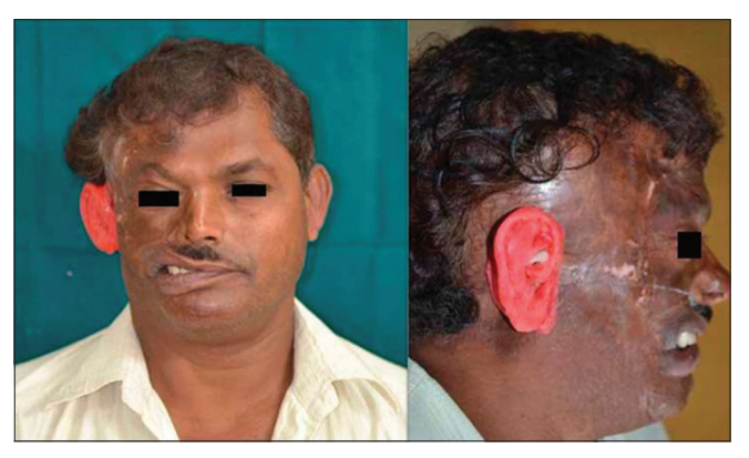
Figure 6: Trial of waxed up ear on patient's face-frontal and profile view

Not using adhesives long-term can prolong the life of the prosthesis. Specifically, they eliminate disengagement caused by surrounding soft tissue movement or perspiration, which can result in loss of contact of the silicone prosthesis margins. Furthermore, elimination of adhesives can eliminate tissue irritation. The implant-retained auricular prosthesis has become a viable treatment alternative for auricular deformed patients because of its predicable results.<sup>[7]</sup> Branemark intraoral implants were used in the present case. Extra-oral implants differ from