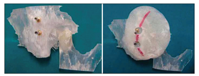
Figure 2: Surgical stent fabricated on the stereolithographic model of temporal bone

Another acrylic triangle of similar dimensions as the original was fabricated to support the magnets of the opposing poles to be embedded into the final prosthesis. It was ensured that the magnets were of differing polarities such that the two triangular shims fit together in only one orientation. Care was taken to ensure proper incorporation of the magnets with