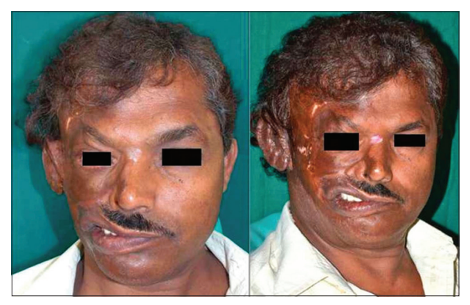
Figure 7: Final prosthesis-frontal and profile view

intra-oral in terms of length and prosthetic platform. Ideally, small length implants are placed in the auricular region. However, in this case, there was sufficient bone length; hence 10 mm intra-oral implants were placed in the mastoid air cells. Though the inside bone was porous with spaces, the 3 mm cortical bone at the surface gave good primary stability for the implant.