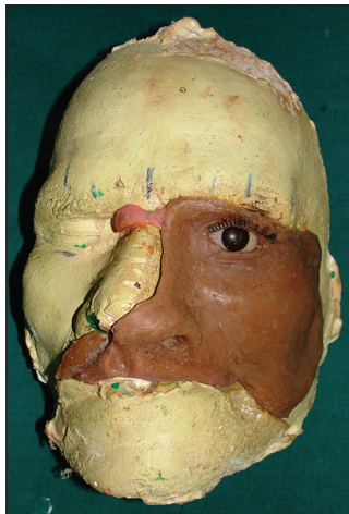
Figure 7: Finished prosthesis