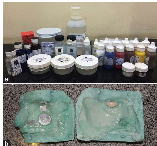
Figure 6: (a) MDX4-4210-base silicone and Silicone Coloring Kit; Factor II, USA (b) Packing of silicone in dewaxed mold