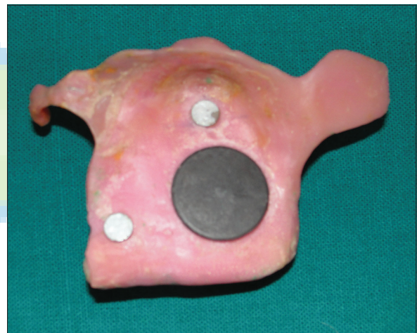
Figure 4: Hollow acrylic substructure with magnets in place